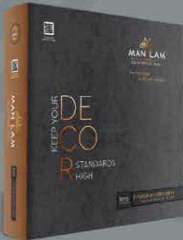
Artistica Collection 2nd Edition