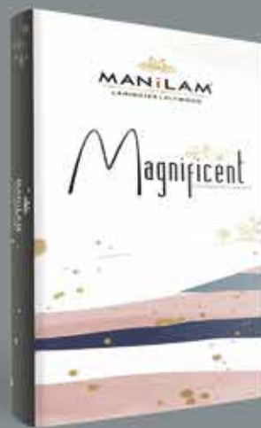
New Magnificent Collection