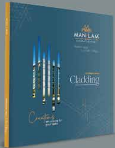
New External Wall Cladding