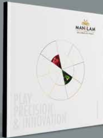
New Colors Collection